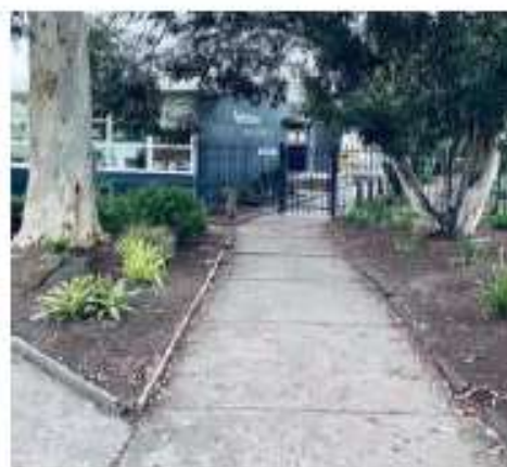
Year 5 & 6 Entry: single gate cnr Robert & McSwain St