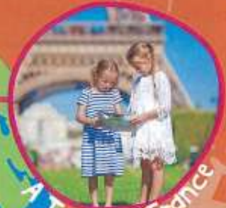
A Taste of France